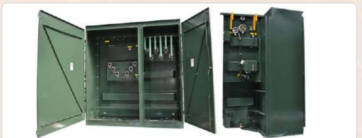
Pad Mounted Transformers