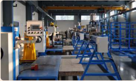
Dust Proof Winding Section