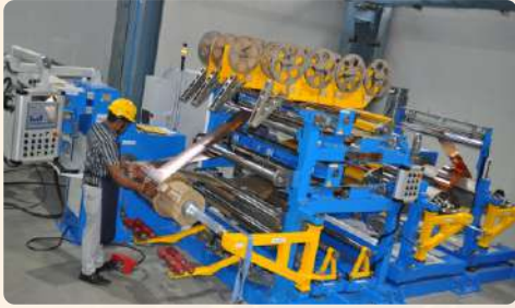
Foil & strip Winding Machines in dust free area