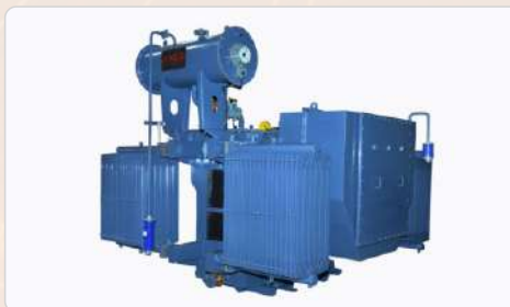
Wind Power Transformers Up to 6.5MVA, 33KV class