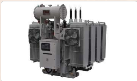
Power Transformers Up to 80MVA, 132KV Class