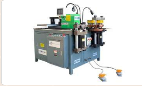
Copper Punching, Cutting & Bending Machine