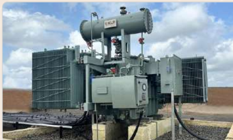
Inverter Duty transformer Multi windings up to 18MVA, 33KV class