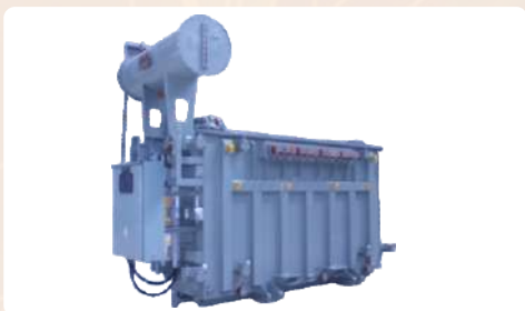
Induction Furnace & Arc Furnace Transformers - Up to 30MVA, 33KV Class