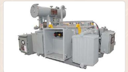
Distribution Transformer 250KVA to 2500KVA up to 33KV Class as per BIS Standards