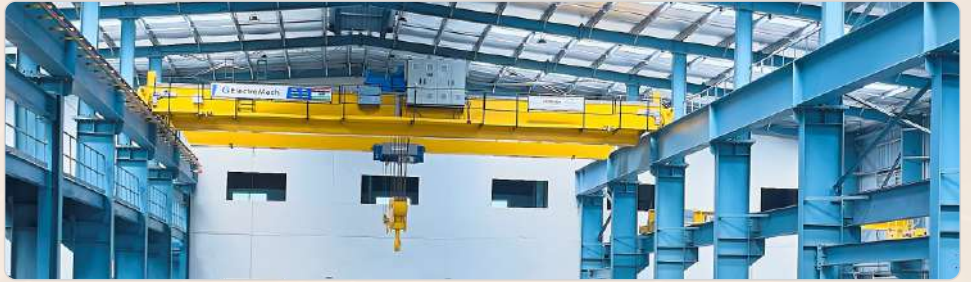
ETO Cranes (80,20,10,5 tonne)