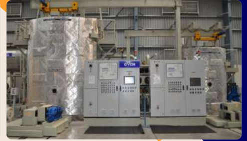
Automated Vacuum Ovens