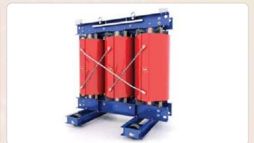
Dry Type Transformers Up to 2500KV, 33KV Class